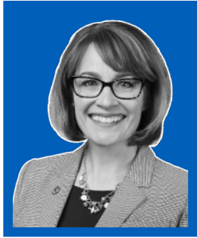
State Senator Meg Loughran Cappel